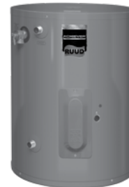
6, 10, 15, 19.9 and 30-Gallon