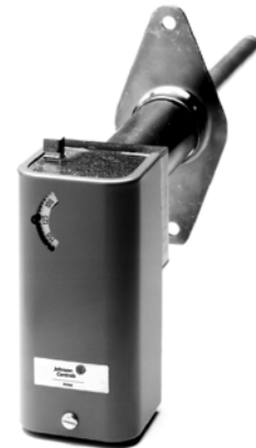
A25AP-1 Warm Air Limit Control