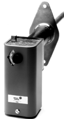
A25AN-1 Warm Air Limit Control